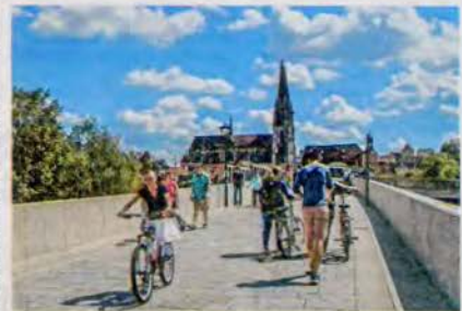
SHIP SHAPE: The Scenic Pearl, top, travels the Danube to such stops as Regensburg, Germany, above.

Words to live by. With the Danube at flood levels, there was no way the 167-passenger